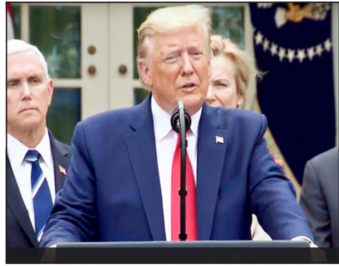
President Donald Trump declared a national emergency over COVID-19 on Friday, March 13.

indefinitely closed its Wellness Center, though the hospital said that, once it determines the length of the shutdown, "all members will have that time added to the end of their membership."