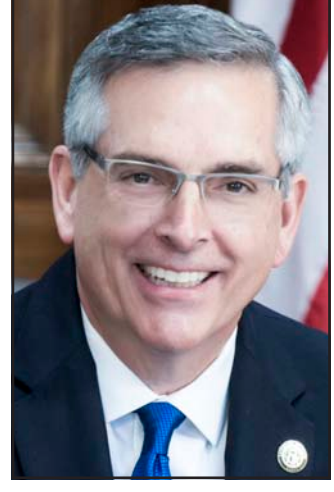
Brad Raffensperger Secretary of State

"Our priority is to protect the health and safety of all Georgians and to ensure that as many Georgians as